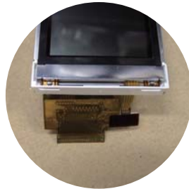
Fine metal burr removal