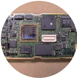
Soldering ball removal

The Air Blaster is the best suited for fine metal burr removal. It can remove the fine burr easily and effectively. It is non-contact type , so it can remove the fine metal burrs, dust and swarf without damaging the work .