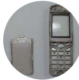
Fine plastic burr removal